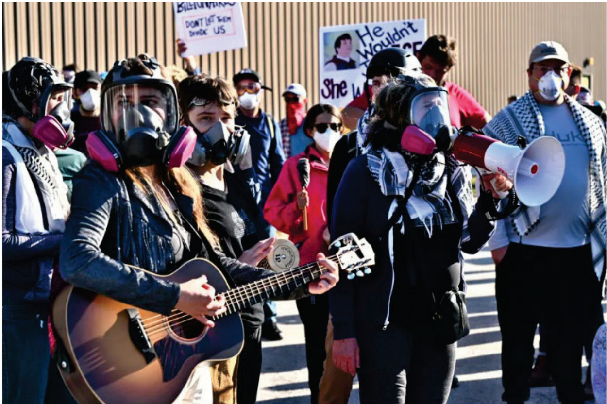
Protesters demonstrated Friday morning outside the Broadview ICE facility.